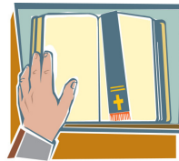
Book of Faith

Book of Faith readings this month are from more of the letters (Epistles) in the New Testament. Do you wonder about the questions that are included for each day? The intent is to get you to think about the reading, or to think about it in relation to your life. Read the scripture passage, and then spend a few minutes thinking about the question. Open Scripture. Join the Conversation.